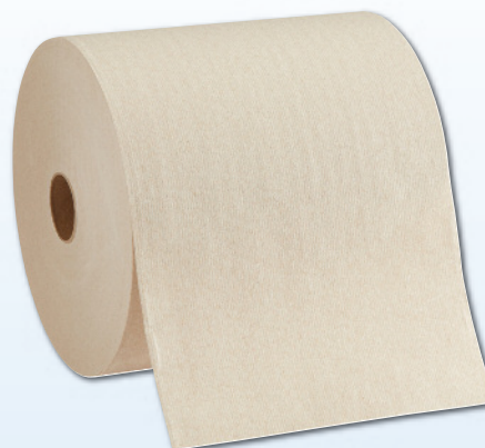
346359 VICTORIA BAY 8" RECYCLED PAPER TOWEL ROLL BROWN • 1150 FT/ROLL • 6 ROLLS/CASE

Affordable Quality: One-at-a-time dispensing helps prevent waste and helps prevent germ transmission.