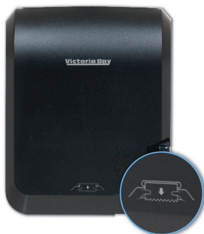
346356 VICTORIA BAY MECHANICAL PAPER ROLL TOWEL DISPENSER 12.9"x9"x16"