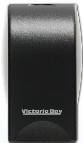
348252 VICTORIA BAY POWERED WHOLE-ROOM FRESHENER DISPENSER 4.1"x3.6"x6.8"

VOC Compliant: Compliant for VOC content with applicable federal and state regulations.