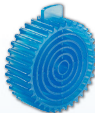
348253 POWERED WHOLE-ROOM FRESHENER DISPENSER REFILL COASTAL BREEZE • 12/CASE

Easy to Maintain: Simple installation and easy access design makes maintenance a breeze.