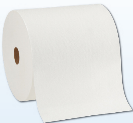
346358 VICTORIA BAY 8" RECYCLED PAPER TOWEL ROLL WHITE • 1150 FT/ROLL • 6 ROLLS/CASE

Affordable Quality: The high-quality choice with one-at-a-time towel dispensing to help prevent waste.