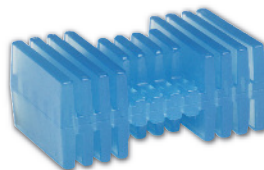
348254 AUTOMATED IN-STALL FRESHENER DISPENSER REFILL COASTAL BREEZE • 12/CASE

Anti-theft: Key and lock provides ample security to help reduce the risk of vandalism or theft.