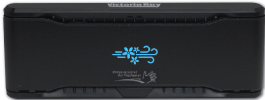
347050 VICTORIA BAY AUTOMATED IN-STALL FRESHENER DISPENSER 1.2"x9.6"x3.5"