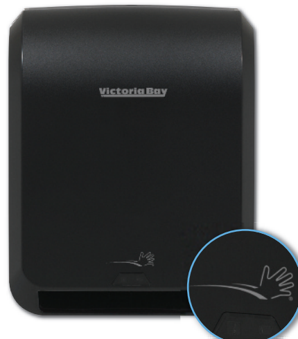
346357 VICTORIA BAY AUTOMATED PAPER ROLL TOWEL DISPENSER 12.9"x9"x16"

Easy to Maintain: High-capacity 1150-ft towel rolls last longer, requiring less maintenance and minimizing refill frequency.